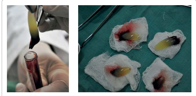
Figure 2: PRF clot removal.

bony defects than open flap debridement alone [14]. PRF has great potential for surgical wound healing and can be used in surgical treatment of intra-bony defects. Further studies are necessary to assess the histology of the regenerated tissue while using PRF.