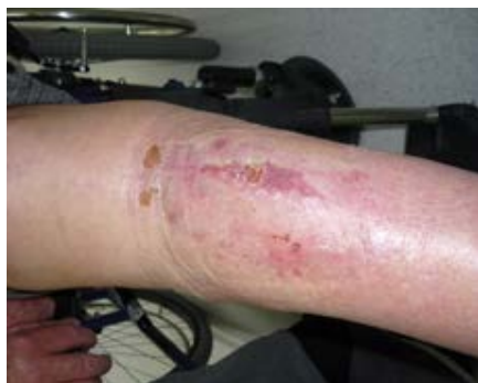
Figure 2: Shows a healed wound after use of this technique.

excess swelling. At completion of surgery the wound is left open and the PICO dressing is applied and negative pressure of -70 mm Hg is started immediately. The bulging tibialis anterior muscle which causes skin tension becomes an ally if the tunnelling is done to have the graft run obliquely deep to the muscle once it crosses the edge of the tibia (Figure 1). The muscle then overlies the graft and the negative pressure dressing can be applied directly over it.