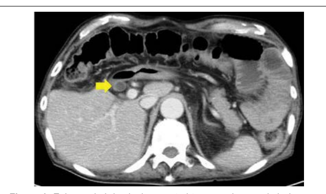
Figure 1: Enhanced abdominal computed tomography on admission revealed dilatation of the common bile duct (arrow), measuring 17 mm in diameter, with ductal wall enhancement.