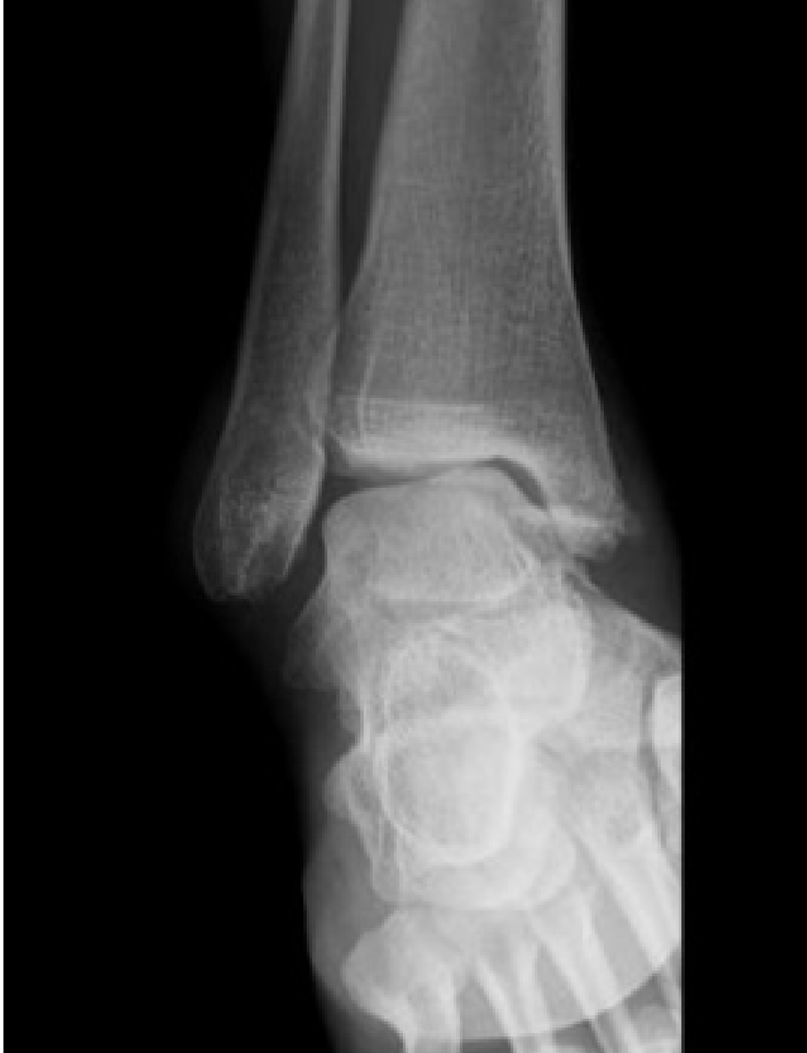
Figure 1: Anteroposterior X-ray of the ankle with significant talar tilt secondary to ankle instability.

The purpose of this review is to compare return to play (RTP) timelines and outcomes between open and arthroscopic treatments of lateral ankle instability in athletes.