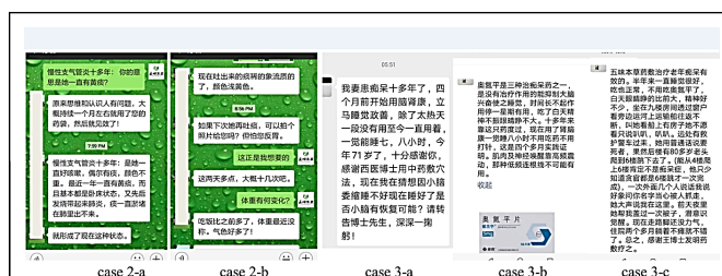
Figure 2: Feedback from caregivers of the 94 year old (Case 2) and the 71 year-old (Case 3) after using the herbal pouch: Case 2a) the cognitive impairments of the 94 year old lady with illogical thinking and inability of recognizing people was completely reversed; Case 2b) the 94 year-old lady has a good appetite and better complexion than before; Case 3a) 71 year old lady with 10 years of dementia has better sleep; Case 3b) the herbal pouch is much better than prescribed drug Olanzapine; Case 3c) the herbal pouch is effective for my wife: she regained awareness and ability of helping me with quilt in the night in addition to having better sleep, appetite and energy.