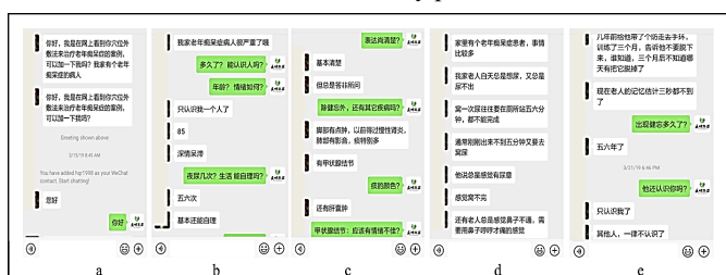
Figure 1A: Symptoms of the 85 year old man before the treatment: a) his caregiver seeks help after reading a blog of treating Alzheimer’s disease with the herbal pouch; b) the patient urinates 5-6 times a night and does not recognize anyone else except his caregiver; c) talk illogically and has edema around ankles; d) have to urinate every 5 minutes, but takes more than 5 minutes to finish the urination, and has nasal congestion most of time; e) he has 5-year history of cognitive impairments with current memory span of 3 second.

The Herbal Pouch of Brain Kidney Enhancer is much better than Olanzapine, which had been prescribed for 10 years by her doctors, but with little improvement for the dementia.