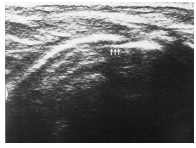
Figure 1: Showing a fresh fracture with interruption of the bone structure (arrows).

Although the fracture clavicle generally heals well without long-term sequelae, our study revealed one baby out of 43 cases of clavicular fracture (2.3%) with Erb's palsy. In a 5-year retrospective study involving 5847 live births, one of the 60 (1.7%) newborns with clavicular fracture had Erb's palsy [21]. In another retrospective review of 21,632 live births, clavicular fracture was found in 58 newborns, three (5.2%) of whom had concurrent Erb palsy with good recovery [22]. In a survey of 11,636 neonates admitted to the neonatal nursery, 2.29% had clavicular fracture, and 0.44% had Erb's palsy [4]. As Erb's palsy is not our concern in this study, and this incidence may not be true for Erb's palsy because of small sample size.