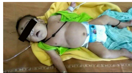
Figure 1: The figure shows the severe intercostal retractions.

low Hb levels 1 unit of PRBC was given and laparoscopic fundoplication was done under GA. Post operatively child was shifted to PICU and kept for NBM for 48 h (given NG feeds) later allowed oral feeds for which child tolerated well and was observed for 48 h Post-surgery, child was accepting feeds well with no history of any cough and regurgitation of food contents.