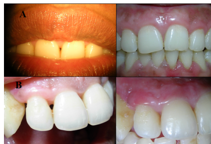
Figure 2: Pre and post operative 6 month: (A) case 2 and (B) case 6.

Primary closure was obtained at the donor site by placing aluminum foil over the incision area to avoid entanglement of suture within the periodontal dressing placed with stent (Figures 2 and 3).