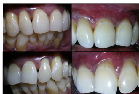
Figure 3: Pre and post operative 6 month: case 8.

A split thickness flap was initiated from the initial semilunar incision toward the sulcular incision to completely mobilize the gingivo-papillary unit. This flap was undermined carefully below the papilla towards the palatal mucosa initially using Orbans knife and extended palatally using a disposable microsurgical knife. Care was taken to avoid perforating the palatal mucosa and to prevent exposure of the alveolar crest in the interdental region. Once the gingivo-papillary unit was completely released, blunt dissection was performed on the palatal aspect to release all the attachments from the tooth surface and to allow for the coronal displacement of the papilla (Figure 4).