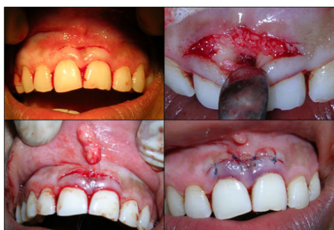
Figure 1: Surgical phase: initial incision (top left); tunneling completed under deficient papilla (top right); connective tissue graft inserted into the tunnel (bottom left); primary closure achieved using 6-0 polypropylene suture (bottom right).

A partial thickness semilunar incision was placed 1 mm coronal to the mucogingival junction. It extended to at least one papilla on either side of the defective papilla (Figure 1). Subsequently, an intra sulcular incision was extended all around the neck of teeth forming the boundary of the defective papilla, and towards the initial incision on labial aspect. This ensured that the interdental papilla was kept intact.