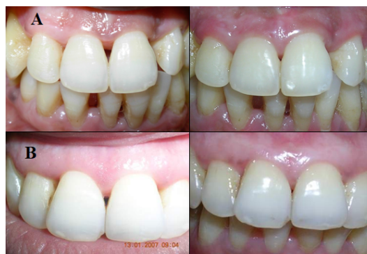
Figure 4: Pre and post operative 6 month: (A) case 6 (B) case 3.

A split thickness flap was initiated from the initial semilunar incision toward the sulcular incision to completely mobilize the gingivo-papillary unit. This flap was undermined carefully below the papilla towards the palatal mucosa initially using Orbans knife and extended palatally using a disposable microsurgical knife. Care was taken to avoid perforating the palatal mucosa and to prevent exposure of the alveolar crest in the interdental region. Once the gingivo-papillary unit was completely released, blunt dissection was performed on the palatal aspect to release all the attachments from the tooth surface and to allow for the coronal displacement of the papilla (Figure 4).