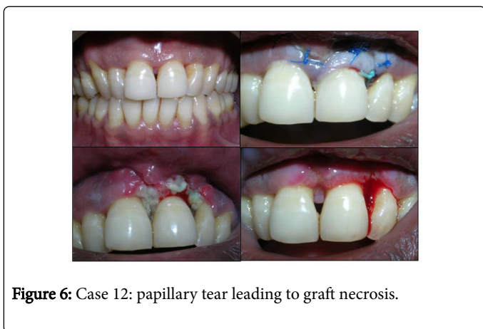
Figure 6: Case 12: papillary tear leading to graft necrosis.

The patients were prescribed Cap Amoxicillin, 500 mg 1 capsule three times daily for 3 days, Tab Ibuprofen 400 mg 1 tablet SOS and 10 ml of 0.2% Chlorhexidine gluconate mouthwash twice daily for a period of 4 weeks. Patients were advised to avoid lifting the lips and touching the surgical sites with finger or tongue. Brushing and flossing of the region were discontinued for 4 weeks. On the third day post operatively, the stent with pack was removed along with sutures from palatal donor site. Remnants of soft tissue deposits were removed gently with moistened gauze pieces and the area was irrigated with normal saline. Sutures from the recipient site were removed after 1 week (Figure 6).