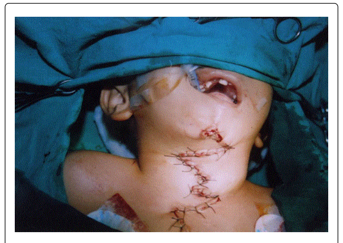
Figure 3: Fourth surgery for complete excision of scar and contracture with multiple unequal 'Z' plasty.

Total excision of the cervical teratoma was done at the age of 48 hours. Post-operative period was uneventful and histopathological examination came out to be teratoma. At the age of 3 months, repair of upper lip by 'Z' plasty, lower lip by 'V' excision and repair and chin repair was done. After removal of teratoma, extending from the chin down to the manubrium sternum was a firm band over which the skin was freely movable Third surgery to release cervical contracture and full thickness skin grafting was done. Fourth surgery for complete excision of scar and contracture with multiple unequal 'Z' plasty as performed (Figure 3). The post-operative period was uneventful and weight of the patient gradually increased. Patient is on regular follow up and is stable (Figure 4). Further surgeries required in future are orthodontic repair of teeth and fixation of mandible.