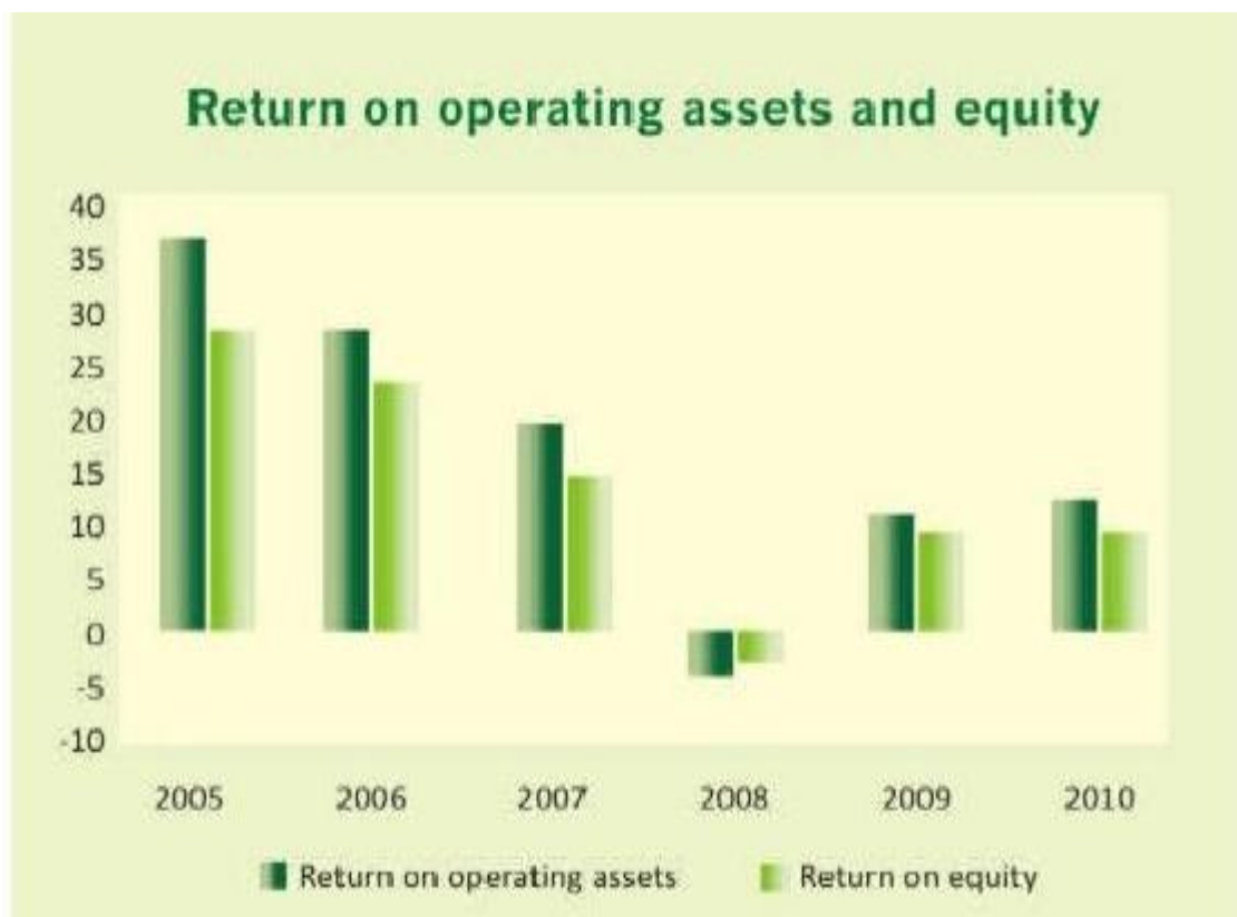
Fig: Key Performance Indicators of PTCL

The financial indicators are showing that there has been a consistent decline in the financial ratios of PTCL from year 2009 to year 2011 ( years of concern for research ). The performance indicators neseccary to represent the overall financial helath of a company are only taken into account that is gross margin, net margin, return on opeartaing assets and return on equity. Among number of other factors, which contributes to the poor performance of PTCL, one has been the poor work environment, non availability of proper office infrastructure, too much work load and low pay benefits as compared to work input, which ultimately demotivates the employees and dissatisfies them from their work. The net result, hence , is the bad performance of employees, which, ultimately affects the performance of the organization as a whole.this supports the null hypothesis 1 and null hypothesis 2 very strongly.