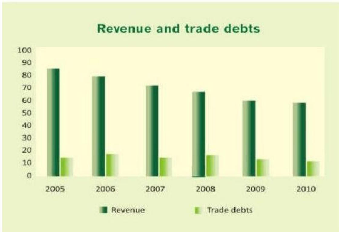
Fig. Revenue and Trade Debts