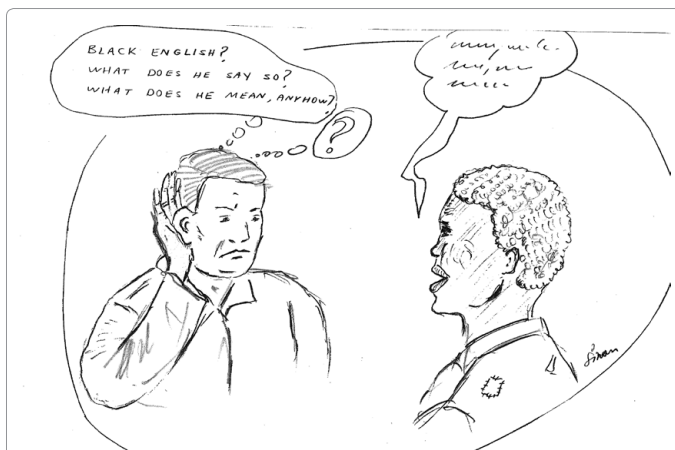
Figure 1: Speech is an important aspect of individuals. The different dialect of Afro-Americans may in general contribute to their being discriminated against, by the whites.

However; if the encountered white is an armed figure of authority, say, a policeman, in that case the black man is afraid at the mere sight of his. Moreover, this fear of the black man is not paranoia ; as a black psychiatrist, in a post-modern consideration, would try to explain, in repudiation of the white man’s science (or at least in questioning the science so far established by a white mentality)!