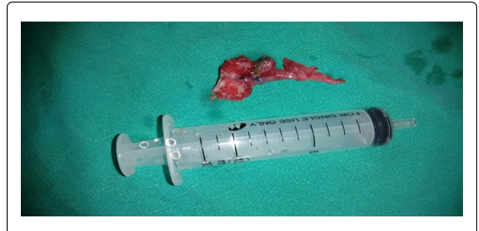
Figure 3: Specimen of thyroglossal tract with hyoid bone attached at one end and sternohyoid muscle at other end.