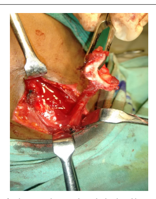
Figure 2: fistula tract with one end attached to hyoid bone and other end attached to stenohyoid muscle.

A thyroglossaal fistula is often caused by spontaneous rupture of thyroglossaal cyst or inadequate excision of thyroglossaal cyst or tract. When thyroglossaal fistula is presented with multiple tracts, the tract may end at different sites of neck. Our case shows one type which is having two tract one ending at hyoid bone and other ending over strap muscle of neck. This report shows that there is a possibility that anomaly can be seen in a simple case, hence we should always keep in mind and look for a possible associated or concurrent lesion. Hence this case is reported.