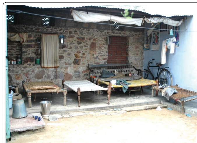
Figure 1: Open tin shade of the house showing cots on which body of deceased were reportedly found. No sign of vomit was detected.