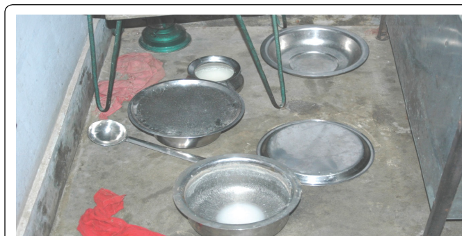
Figure 4: Close view of steel utensils found inside the room containing food material ( Rabdee ).

sealed injection vials of REGLAN, AMICIN, dextrose bottles and many packed and unused syringes were found. The utensils in the kitchen were found clean and unused (Figure 1 and Figure 2).