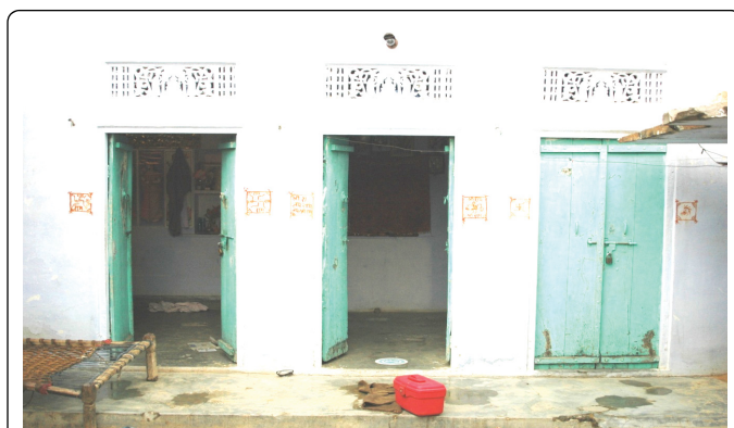
Figure 2: Photographs showing rooms of the house.