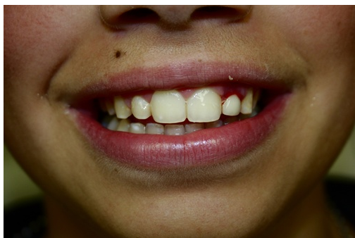
Figure 4: Post-op crown cemented with temp cement Patient is scheduled in 2 weeks for follow up.