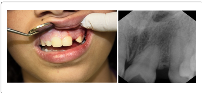
Figure 1: (a) Missing #10. Short clinical crown #7. Diastema between #9 and 11 (b) Pre-op periapical radiograph. #9 angled slightly distally, #11 slightly mesially.

Objectives of the orthodontic treatment were: