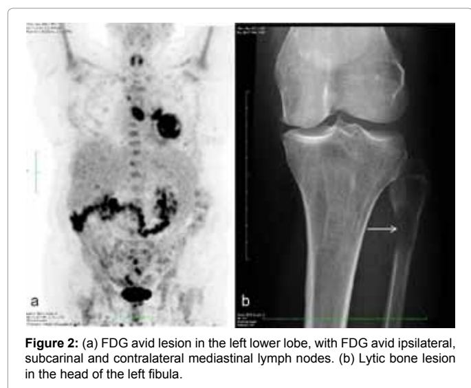
Figure 2: (a) FDG avid lesion in the left lower lobe, with FDG avid ipsilateral, subcarinal and contralateral mediastinal lymph nodes. (b) Lytic bone lesion in the head of the left fibula.