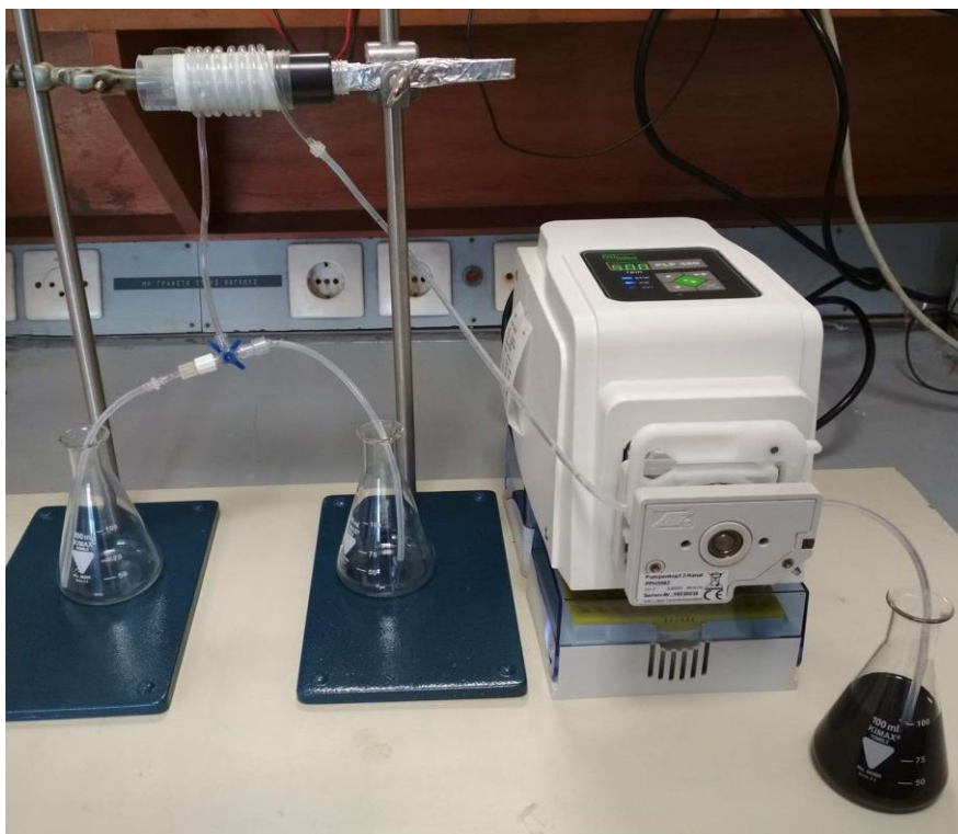
Figure 1: View of the entire apparatus before separation.