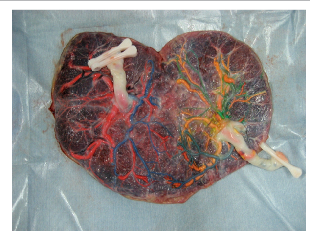
Figure 1: Dye injections into vessels of monochorionic placenta after delivery.

Additionally, the operator should be trained to identify and characterize the vascular anastomoses of the monochorionic placenta. Placental dye injection examination [8,9] of the monochorionic placenta should be an important step before attempting laser surgery (Figure 1). All vessels on the placental surface can be precisely differentiated by fetoscopic inspection; arteries principally cross over veins and the color of arteries is dark blue due to deoxygenated blood, whereas veins appear bright red due to oxygenated blood from the placenta. AA and VV anastomoses are directly linked artery-to-artery or vein-to-vein, and have no terminal ends. While AV anastomosis is not anatomical anastomosis itself, the artery (feeding artery) comes from a fetus to cotyledon, and goes to the other fetus as drainage vein. It is called an AV anastomosis. Occasionally, three or four vessels cotyledons are seen, in which three or four types of different vessels are in to same cotyledon. AA anastomoses are theoretically complex and bidirectional transfusion depends on the location of the hemodynamic equator and branch of artery. This mechanism can provide AA anastomoses as