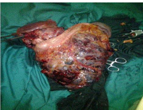
Figure 3: Surgery part of a large GIST with spleen and liver involvement.