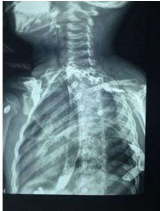
Figure 1: Contrast leak at the mid-cervical esophagus.

removed at 10th post-operative day and he was discharged from hospital a day later.