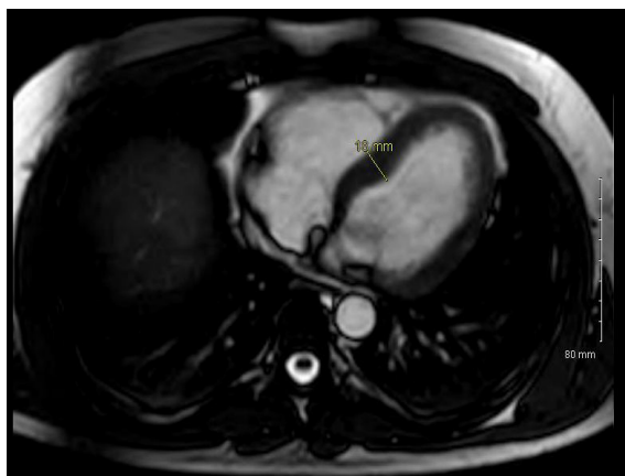
Figure 1: Cardiac MRI demonstrating LVH with septal thickness of 18 mm.

With the diagnosis of HCM along with the history of sudden cardiac death of his first degree relative, he was referred for genetic counseling at the Genetic-Arrhythmia Clinic for further evaluation. Cardiac magnetic resonance imaging (MRI) showed HCM with a maximum interventricular septal dimension of 18 mm (Figure 2) and a posterior wall dimension of 17 mm. There was no evidence of LVOT obstruction. There was a hyperdynamic left ventricular (LV) function with an ejection fraction of 64% and a normal right ventricle (RV) size, wall thickness, and systolic function. His genetic testing demonstrated a