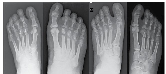
Figure 2: Postoperative radiographs following DMMO.

At 12 months of follow-up, all patients were satisfied with the outcome, and were able to walk without limitations in distance and with no footwear restrictions (Figure 3).