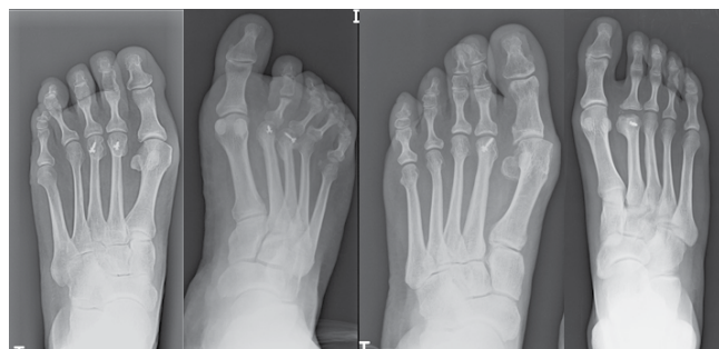
Figure 1: Preoperative radiographs of patients with persistent metatarsalgia following open surgery with Weil osteotomies.

We present four clinical cases of patients surgically treated using Weil osteotomies, in whom the symptoms of metatarsalgia persisted. Two patients had received osteotomies of the second and third rays for isolated metatarsalgia, the third patient had undergone osteotomy of the second ray in the context of hallus valgus, and the last patient had undergone osteotomy of the second metatarsal to treat Freiberg disease